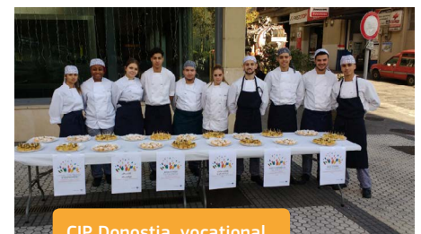
CIP Donostia, vocational school, Spain